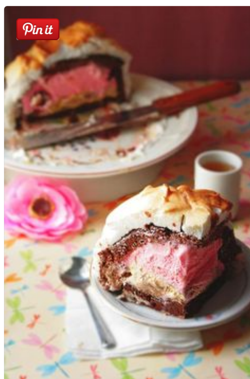
Baked Alaska recipe

Fingerprints from Conde Nast daily edit.