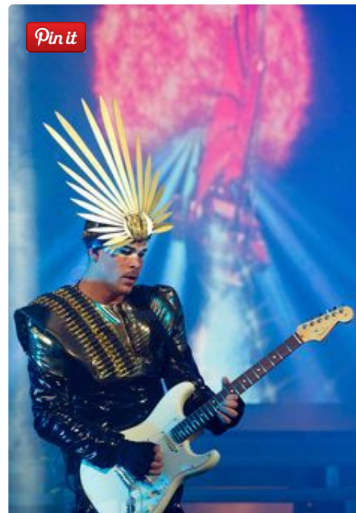
Luke Steel of Empire Of The Sun

Fingerprint Fingerprints from Conde Nast daily edit.